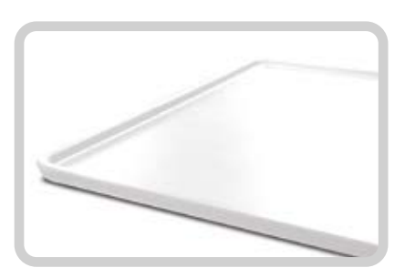
ELEGANT SOFT CONTOUR Slimline Design