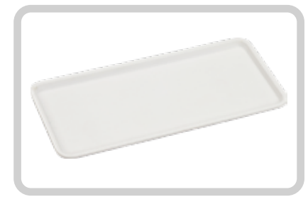
SERVICE TRAY EH50615

Dimensions: 358 x 258 x 10mm Weight: 0.50kgs