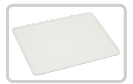
MAIN TRAY EH50614

Dimensions: 358 x 258 x 10mm Weight: 0.50kgs