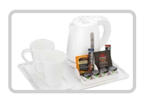
Available with GUILDFORD Kettle