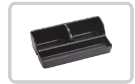
AMENITY HOLDER EH50596

Dimensions: 235 x 110 x 10mm Weight: 0.135kgs