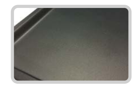
BLACK MATT Finish