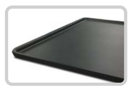
ELEGANT SOFT CONTOUR Slimline Design