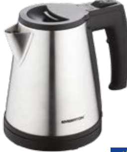
Design Protected by International Registered Designs & Patents Pending • Emberton Group Inc

Design Protected by International Registered Designe & Patente Pending © Emberton Group Inc