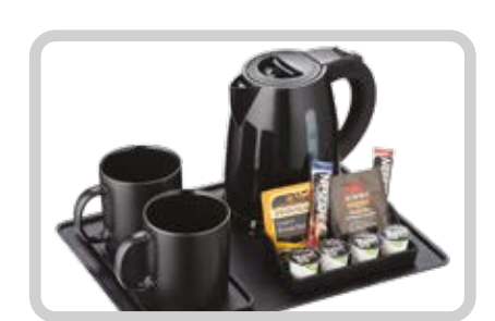
Available with GUILDFORD Kettle