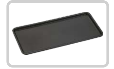
SERVICE TRAY EH50595

Dimensions: 358 x 258 x 10mm Weight: 0.50kgs