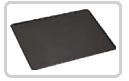
MAIN TRAY EH50557

Dimensions: 358 x 258 x 10mm Weight: 0.50kgs