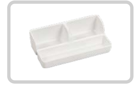
AMENITY HOLDER EH50616

Dimensions: 235 x 110 x 10mm Weight: 0.135kgs